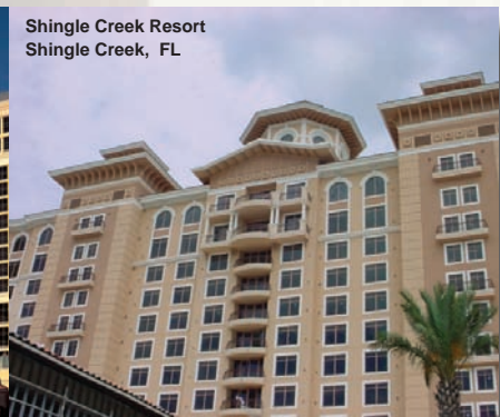
Shingle Creek Resort Shingle Creek, FL

www.dryvit.com www.dryvitisgreen.com www.dryvitcare.com