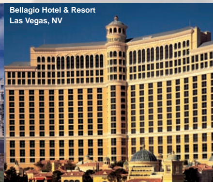
Bellagio Hotel & Resort Las Vegas, NV