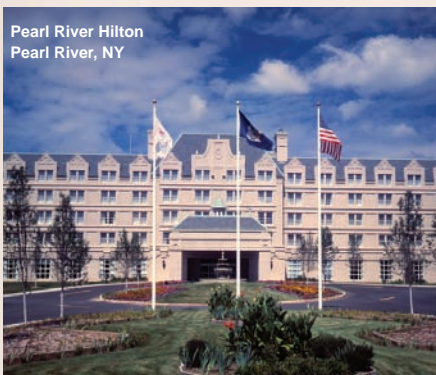
Pearl River Hilton Pearl River, NY