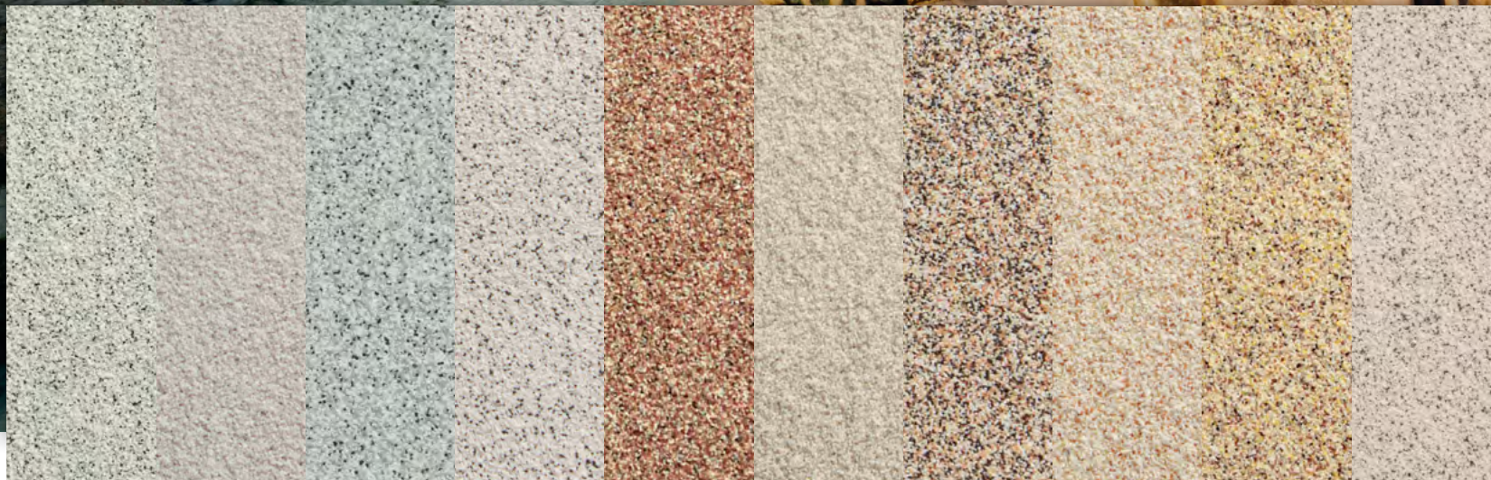
103 Moon Glow

Misty smooth stones dappled with specks of color available in 10 standard shades.