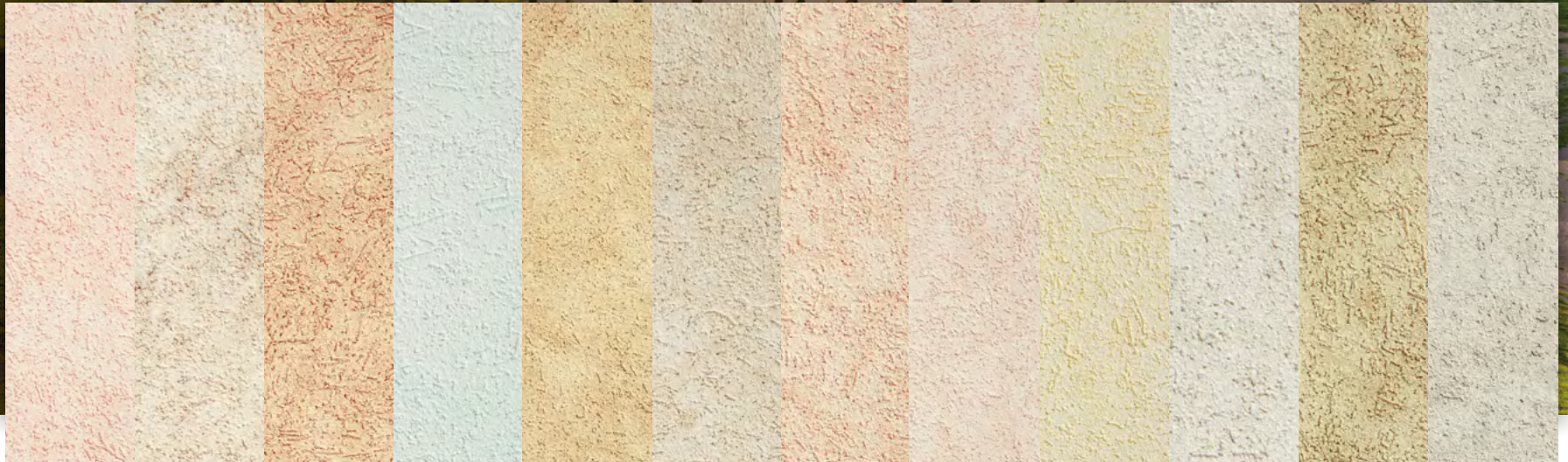
802 800 808 810 811 806 801 803 807 804 809 805 Morning Petal Metropolitan Salmon Blue Haze Maple Walnut Heather Cool Mist Bermuda Sand Buttercup Platinum Gray Sage Northern Gray

Old world style and a contemporary design aesthetic are achieved with 12 standard colors.