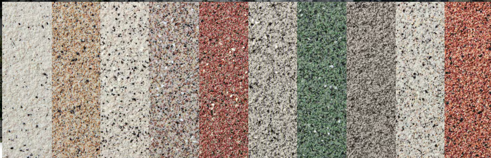
011 Pearl Haze

An elegant architectural stone finish with flecks of quartz available in 10 standard finish colors.