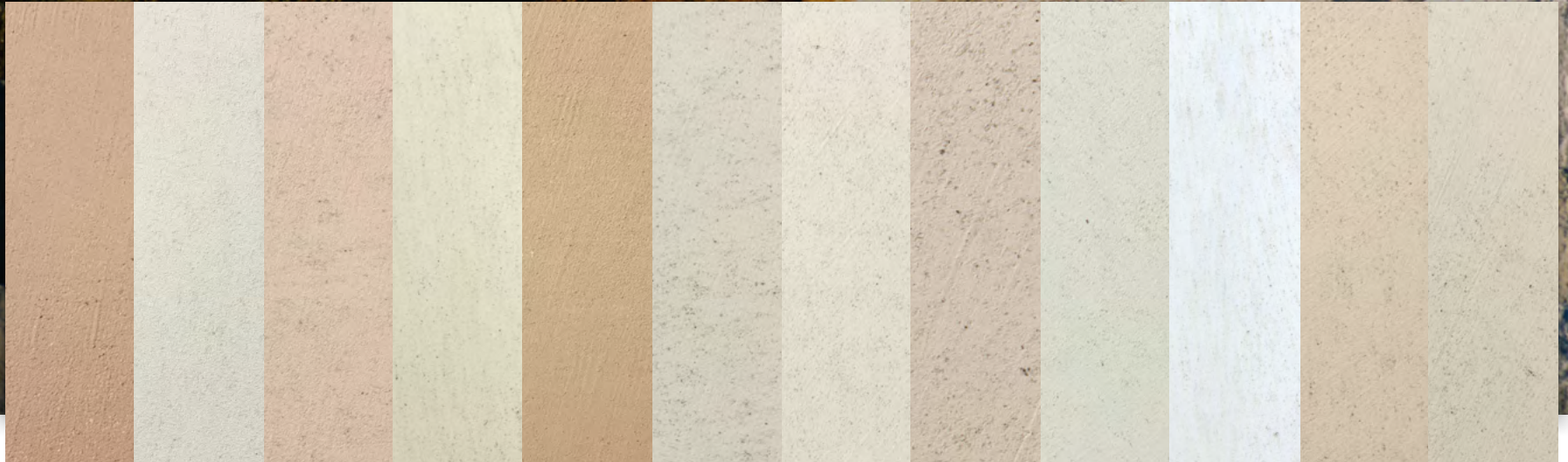
861 San Andreas

Natural quartz, sand and other minerals make up the 12 standard colors.