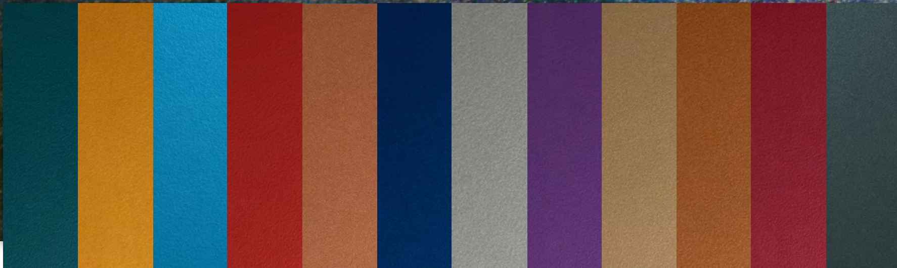
250 259 260 261 252 251 255 258 257 253 254 256 Teal Magnolia Maize Caribbean Chili Pepper Hammered Copper Starry Night Tin Man Barney Champagne Cleopatra Sierra Rose Mediterranean

Reflectit exterior adds a lightweight, shiny metal look to any facade. The 12 standard colors are available in matte smooth and vibrant textured finishes.