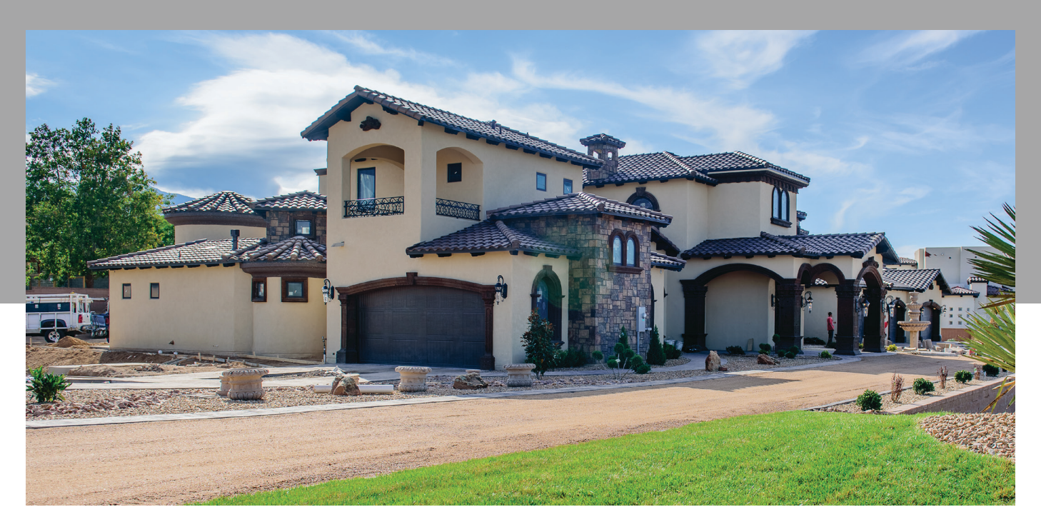
Residence | Tucson, Arizona